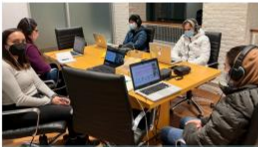
Women Unite group, IINE's peer support group for Afghan women, received GLCF funding.

“With the influx of new refugees and immigrants arriving in Greater Lowell, GLCF is leading the effort to provide support to local nonprofits charged with these resettlements. The GLCF Refugee and Immigrant Resettlement Fund will support the efforts of Greater Lowell organizations to help ensure those in need are welcomed and connected with housing, employment, transportation, food, acculturation, and other related support.”